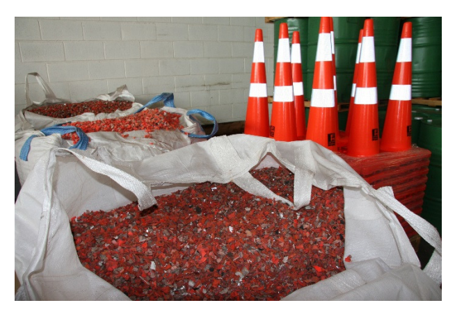
3. Granulated recycled material alongside new cones at the Proline factory

Proline help their customers to avoid landfill costs by recycling these old cones for free. This stewardship of their products is not something that distributors of imported cones currently offer. This is an example of a