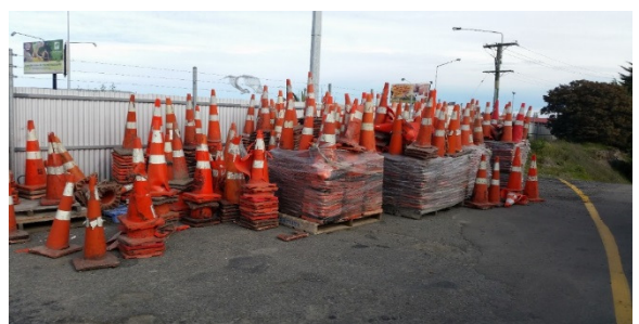
2. 2,000 dead road cones from Fulton Hogan, Christchurch recently recycled by Proline Plastics

While road cones are a source of frustration to many New Zealand motorists, they are a necessary evil, as they play an important part in road safety. Every year, thousands of road cones come to the end of their useful life. They become damaged, or lose their reflectivity, and roading companies have to dispose of them. Auckland road cone manufacturer, Proline Plastics, has developed a process that enables them to recycle old cones into new ones.