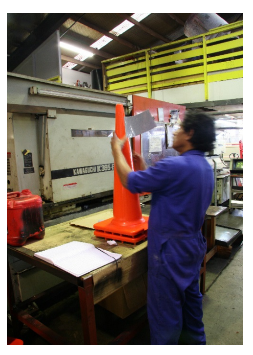
1. New Proline road cones contain around 16% recycled PVC from old cones

PVC (Polyvinyl Chloride) is a thermoplastic, and like all thermoplastics, it is fully recyclable. PVC also has particular properties